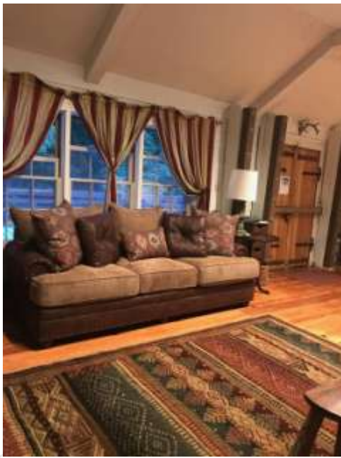
A comfortable new couch